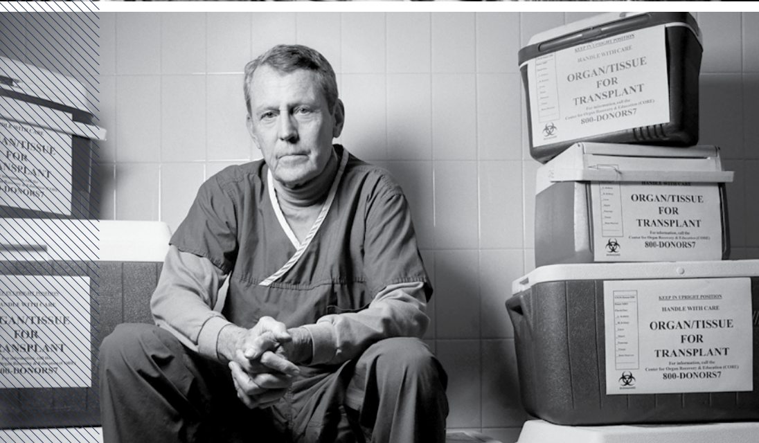
Dr. Jonas Salk's polio vaccine research team at work; organ transplantation pioneer Dr. Thomas Starzl

[1962] Niels K. Jerne, MD, undertakes landmark research on antigen-antibody interactions. Two articles produced during his time at the School of Medicine were among those later cited by the Nobel Committee as providing the basis for his prize-winning work.