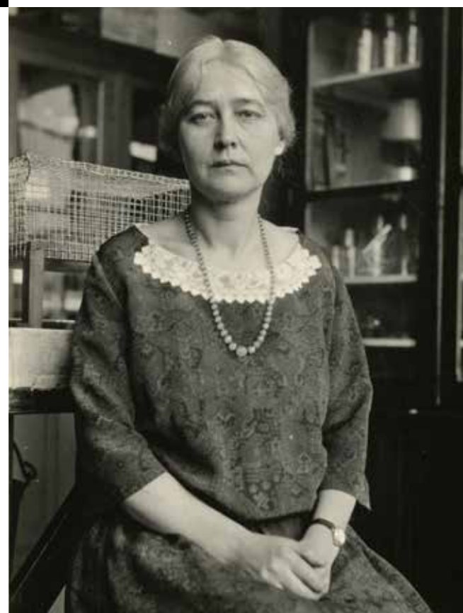
Canadian-born physician and biochemist Maud Leonora Menten (1879-1960) made important contributions to enzyme kinetics and histochemistry.